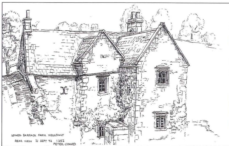
4. Rear view (facing west) of Lower Barrack Farmhouse (formerly Upper Barrack Farmhouse) – unpublished drawing by Peter Coard dated 21 September 1972.

In 1972 the farmhouse (described in 1758 as having ‘three rooms on a floor and usual offices’ – see figs.2 & 3) was still standing, although empty and dilapidated. Fortunately unpublished drawings of this building survive (see fig.4). The rear of Lower Barrack Farmhouse (originally the messuage of Upper Barrack Farm), which could be seen below the retaining wall of the eastern side of Wellsway, appeared to be a late seventeenth/early eighteenth-century dwelling, with chimneys at the gable-ends and a gabled staircase projection. The house frontage (apparently altered in the early nineteenth century) faced east, because until the construction of Wellsway from 1803, access had been from Entry Hill, passing beneath the bridge built over the Lyn Brook (see fig.3). 87